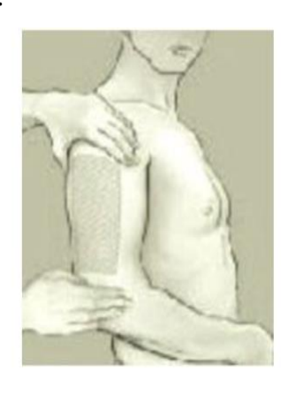
Injection Site on the side of the arm