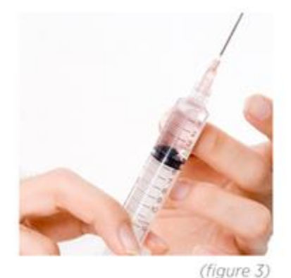
• Keeping the needle in the vial, check for air bubbles in the